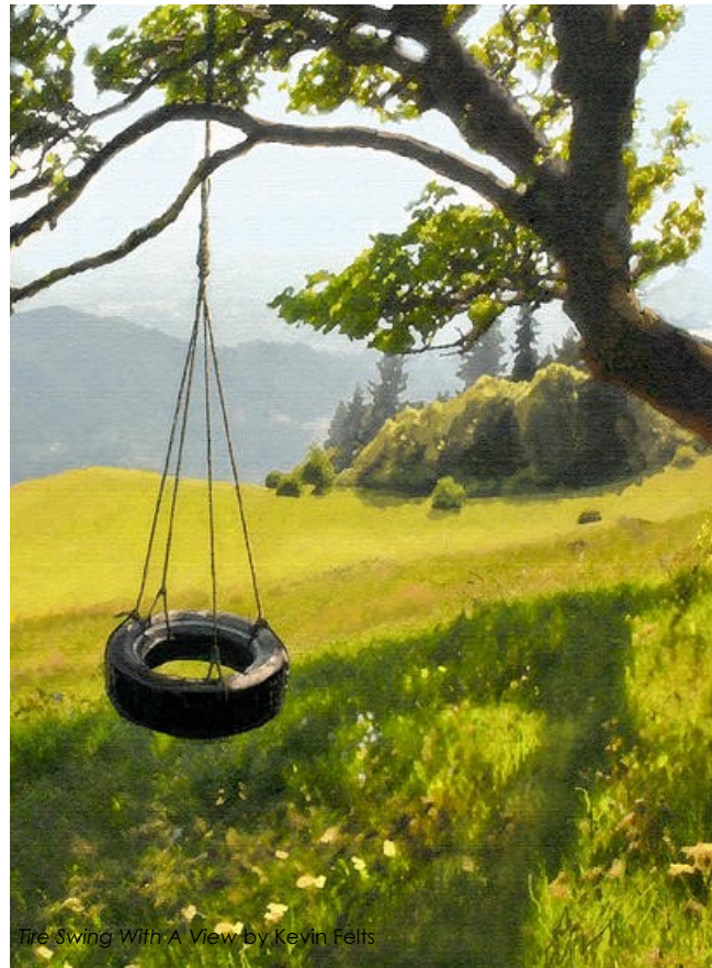
Tire Swing With A View by Kevin Felts