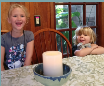
Live Oak's latest family to take home the chalice

Live Oak has a fun new way to share our UU identity and our Live Oak spirit: